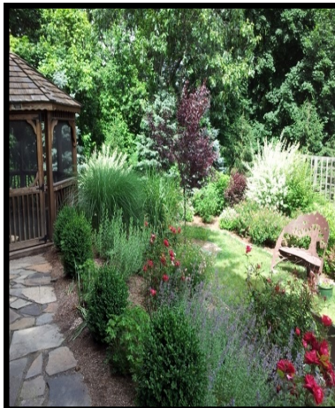
Linda's Healing Garden

Other symptoms may include: fatigue, indigestion, back pain, constipation, pain with intercourse, menstrual irregularities.